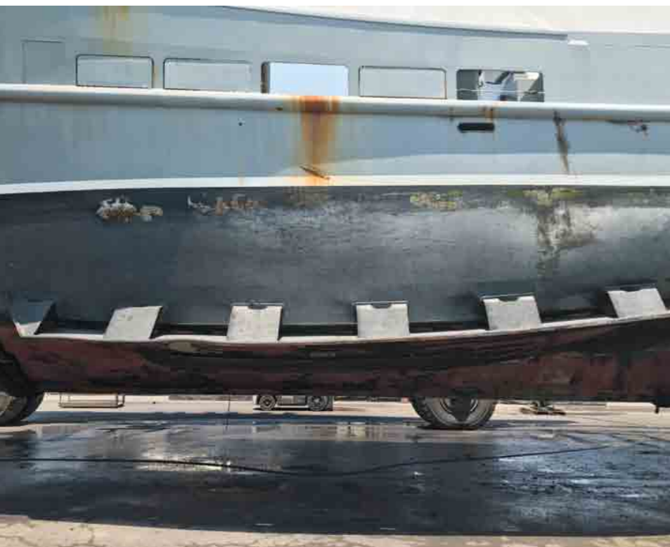
Basic bilge keels fitted to a fishing boat to reduce rolling.

Alley' ranked alongside the Peter Finglas a Queensland DPI patrol boat we built in 2007 and the 26ft power catamaran Double Happiness , a tender for super yacht Double Haven built in 1999 as having been the most complex design and build project we have undertaken. Fine Alley's complexity was in its comprehensive equipment level and bespoke fit out, the Peter Finglas was for the difficulty in fitting, launching and retrieving a 5m long RIB weighing nearly a tonne into the back of