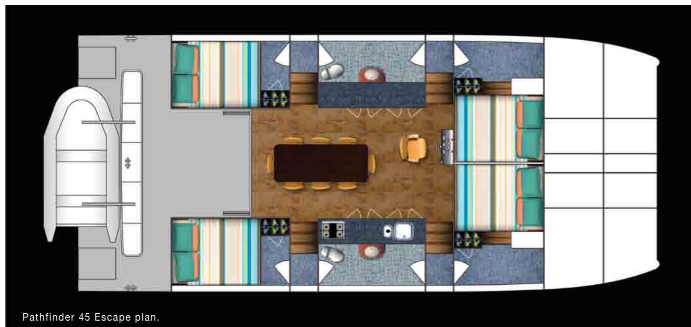
Pathfinder 45 Escape plan.

For further information on the 45 Escape please contact me at peter@pathfinderpowercats.com