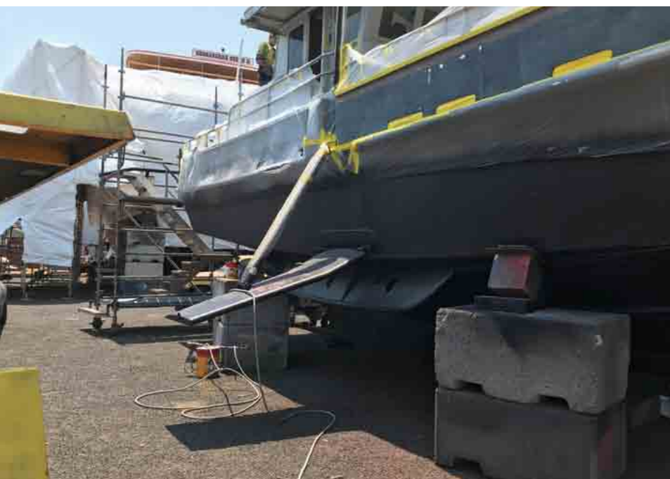
TOP: Stabiliser foils fold up when not in use on another fishing boat to reduce drag.